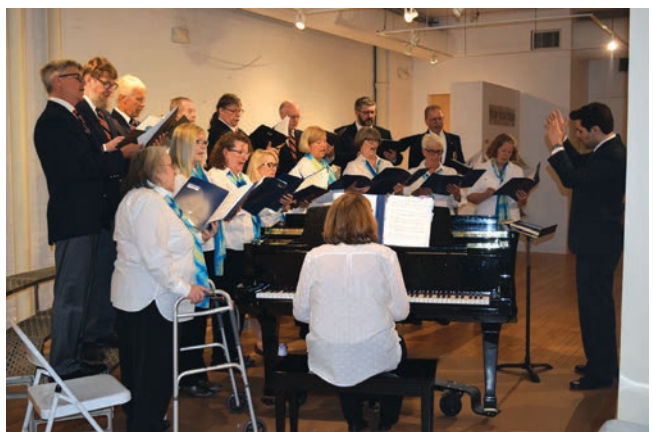
Chicago Mixed Chorus 80th Anniversary concert