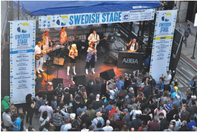
ABBA tribute band at Midsommarfest