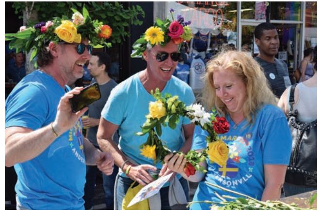
Making flower wreaths at Midsommarfest