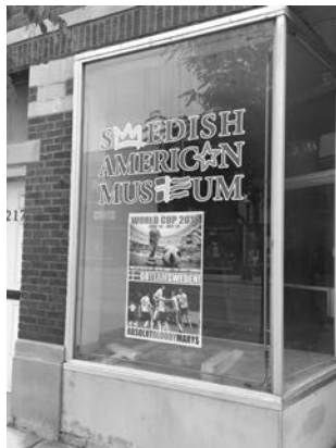
Our new sign in the expansion window

As you walk south on Clark street on your way to the Museum you will have noticed that there is something going on next door. The orange awning of the smoke shop has come down and the windows now proudly hold the logo of the Swedish American Museum. Inside the dust is flying and building noise