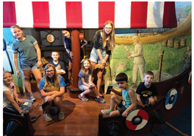
Travel the World Summer Camp