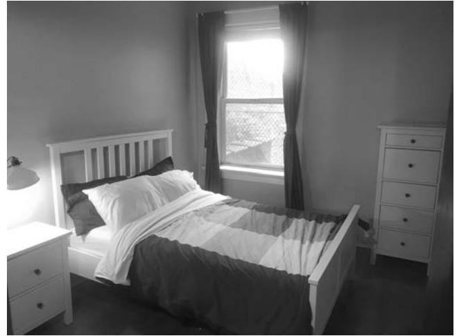
Our new furnished apartment

In the midst of all the happy craziness that is Midsommarfest, an IKEA delivery truck arrived at 5217 N. Clark St. Thanks to a generous donation from Ken Norgan, the apartment did not only see a new coat of paint but brand new furniture as well. Since the summer intern from Sweden, Lina Granberg, had already arrived, she embraced the IKEA all-purpose tool and set to work. With some additional help the apartment is now all set up and ready to use. This is a great addition