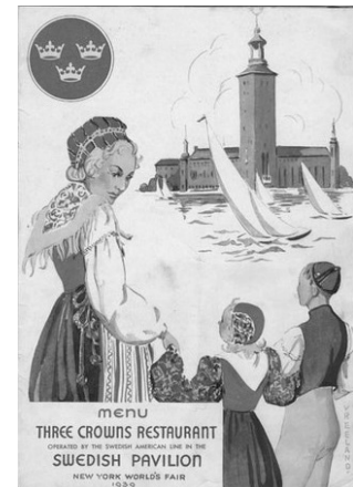
Menu from Three Crowns Restaurant

collection will become subjects of a series of displays in the Museum.