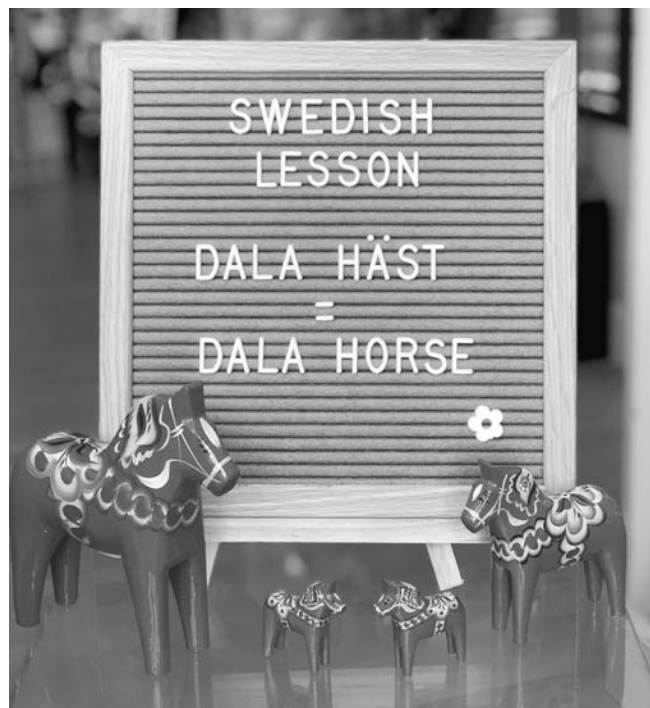
Learn Swedish while you shop