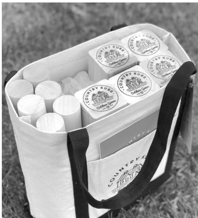
The Swedish lawn game Kubb

My goal for this fall is to make more of our products available online. We hope to make shopping easier for people who cannot come and visit us on a regular basis. Further updates about the web store will come soon! Välkommen or Welcome!