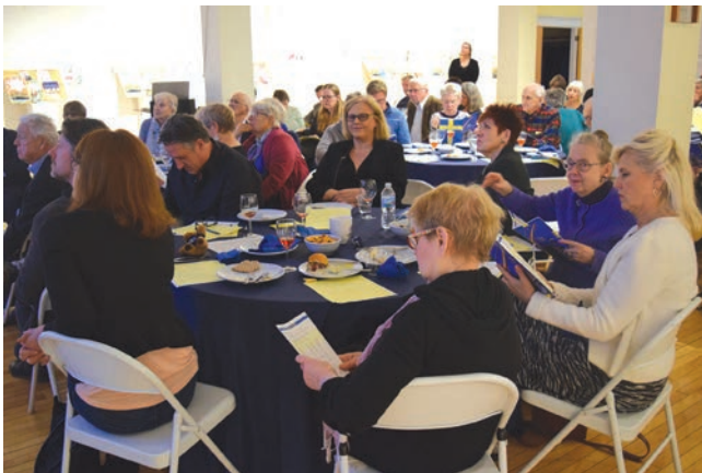
Swedish American Museum Annual Meeting