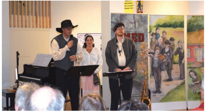
SMED mini musical