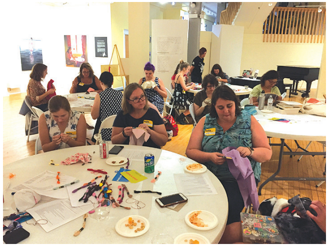
HERstory stitch up