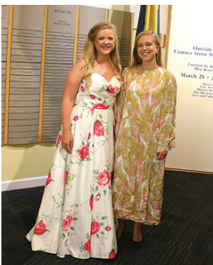
Jenny Lind concert