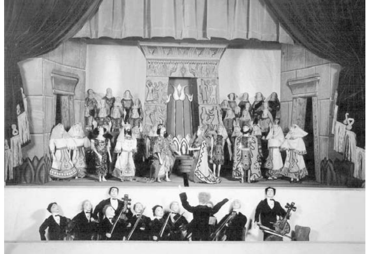
Right: Miniature Opera cast, 1960s