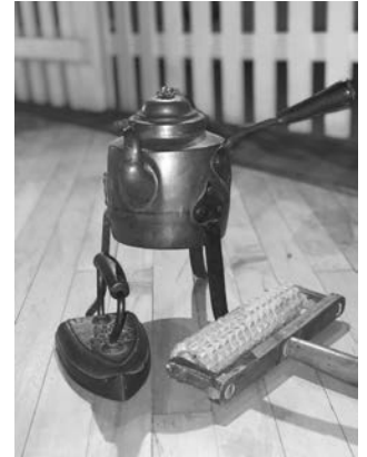
Artifacts you can play with

Today, children sometimes have entire rooms dedicated to toys. Back in the late 1800s, a child may only have a few, and most of the time, they were made with items from around the house. Pinecone animals, dolls made of fabric scraps and carved wooden toys would be a child's treasure. When learning about the past, children often comment on how boring things would be without technology and TV. However, when you think about how much time everything took, there really wasn't much time to be bored. We can throw