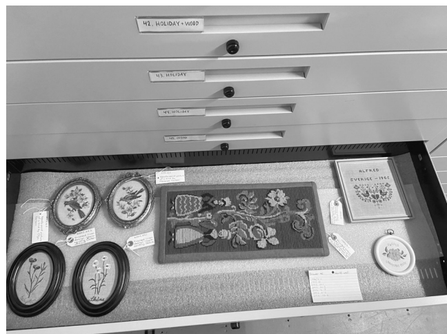
Inside a collections drawer

Our collections' storage area consists of moveable shelves, file cabinets, flat file drawers, bins, clothing racks, and areas for oversized items such as furniture. The moveable shelves hold books and Bibles, a portion of our archives and