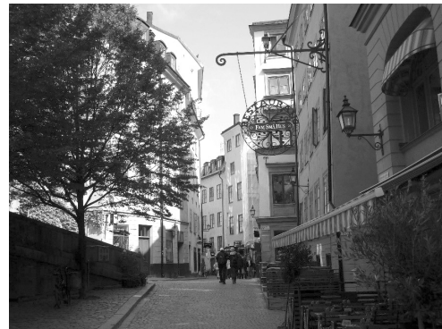
The Old Town