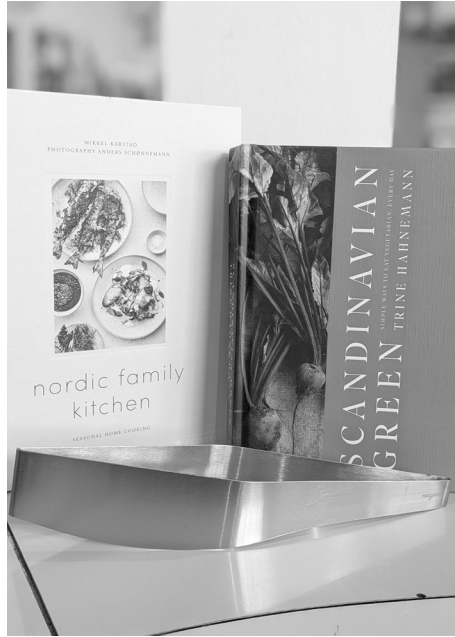
Cookbooks Nordic Family Kitchen and Scandinavian Green featuring the Perfect Cake Server by Magisso.

We look forward to seeing you in our new Museum Store, and we are always eager to assist you with any of your purchases.