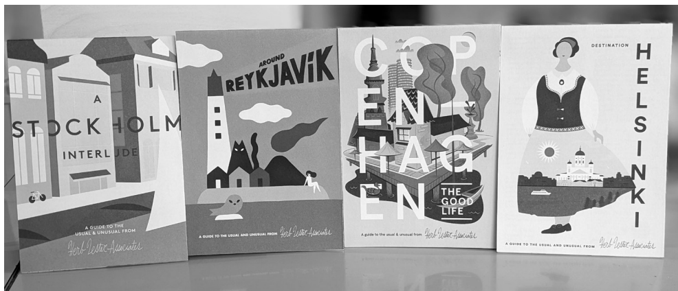
City Maps of Stockholm, Reykjavik, Copenhagen and Helsinki.