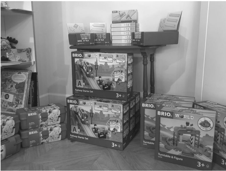
Our exciting new Brio train section