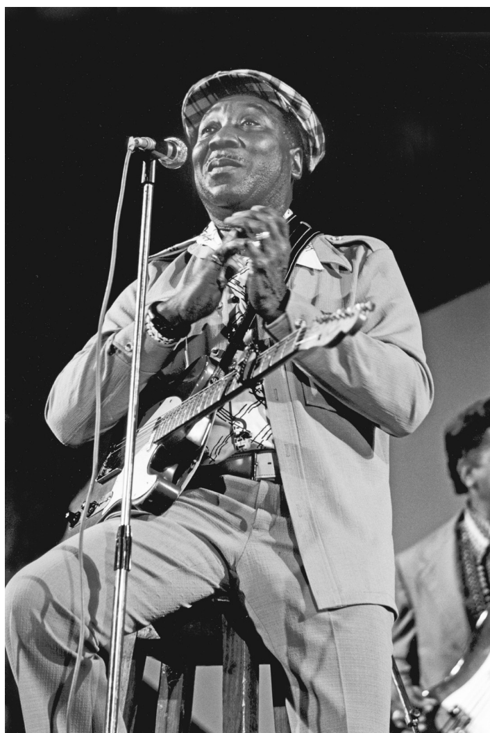
Muddy Waters 1974