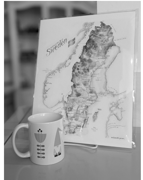
Watercolor Map of Sweden displayed next to a mug featuring a yellow flower and springtime gnome.