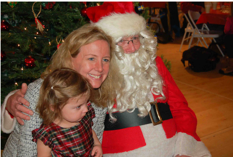
Tomten enjoying the holiday festivities

I hope that the children and their families enjoyed my portrayal of Tomten as much as I did playing him.