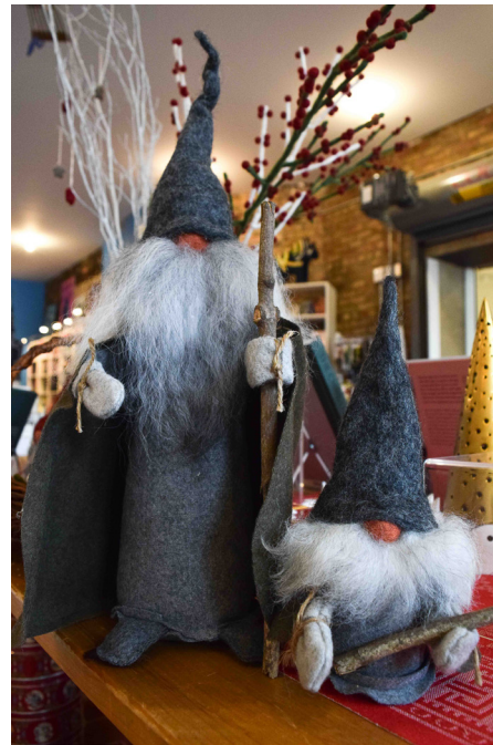
Wool Tomte with Gray Hat and Cane Small $80.00 Large $150.00