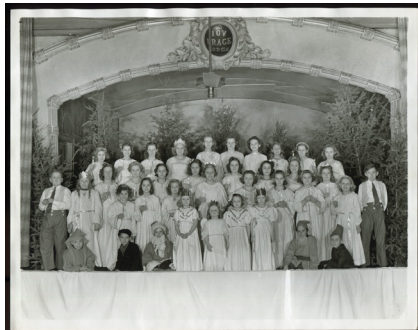
Photograph of a Lucia performance by Värblomman Children's Club, ca 1938-1939. Accession# 1989/51:3.

In Sweden, Christmas Eve is preceded by weeks of celebration. Lucia, which is celebrated on Dec. 13, is a festival of light honoring the Italian Saint Lucia during the darkest time of the year. This popular tradition continues to be celebrated at the Museum every year. In our collection, we can trace the popularity of Lucia festivals and processions in the Swedish-American community over the past 100 years.