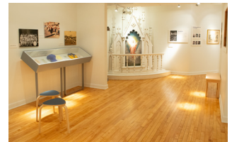
Exhibit Sponsored By