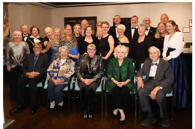
Members of Verdandi Lodge No. 3, I.O.S.