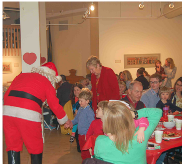
Breakfast With Tomten

The weekend after Julmarknad, on Dec. 14 and 15, we host Breakfast with Tomten. This is a great volunteer opportunity for those who like to serve food, assist with crafts, and play Santa. Another event involving food is Julmiddag, which falls closer to Christmas.