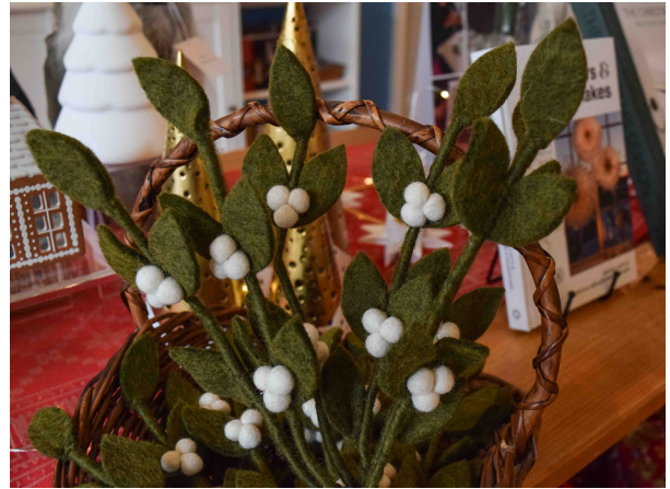
Felted Greenery: Dark Green Mistletoe $24.00