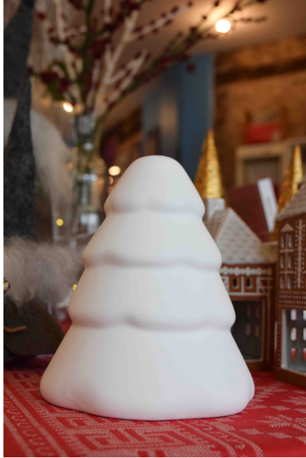
Snowy trees 10cm $42.00 15cm $64.00

Below are some of our new holiday items for purchase and we have others as well!