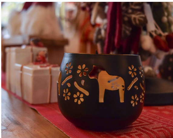
Metal Dala Horse Votive $10.00